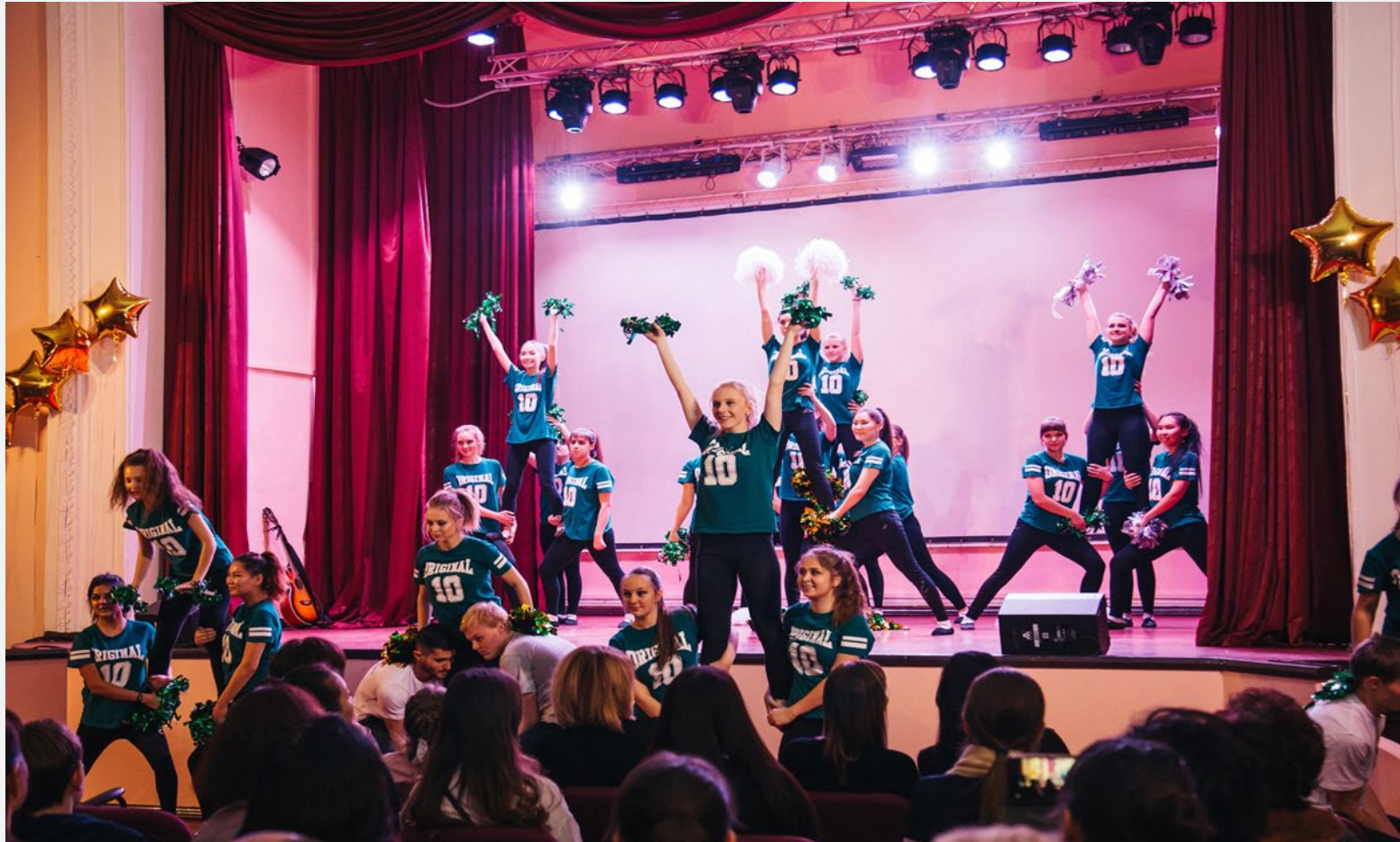
ChSMA Cheerleading team